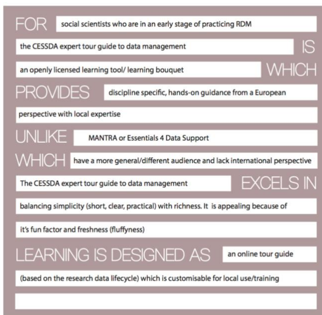
Product statement of the Expert Tour Guide defining - amongst others- the target audience of the module.

The Expert Tour Guide follows the Research Data Life Cycle and is divided into seven chapters that deal with the different aspects of a (typical) research project.