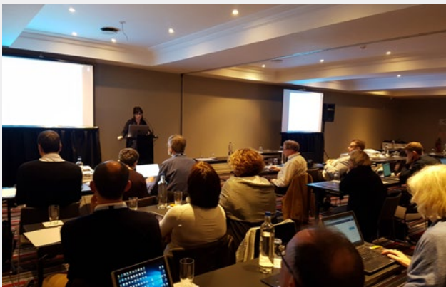
SaW project final meeting, October 2017, Dublin, Ireland.

The project performed a range of activities aimed at strengthening the hub and supporting the development of national data services in preparation for CESSDA membership.