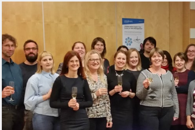
Launch of the Data Management Expert Guide, December 2017.