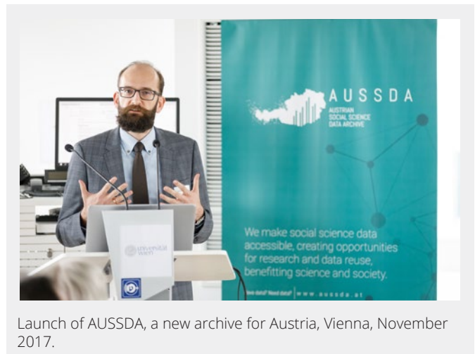
Launch of AUSSDA, a new archive for Austria, Vienna, November 2017.

The UK Data Service was evaluated positively, and its 5-year budget was renewed.