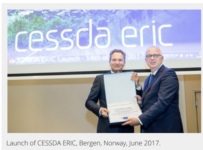
Launch of CESSDA ERIC, Bergen, Norway, June 2017.