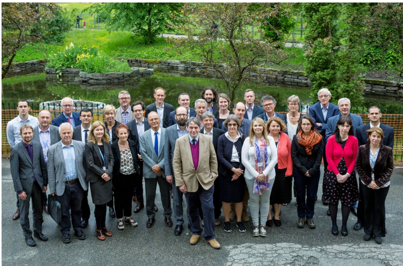
CESSDA General Assembly

meeting of the General Assembly took place in autumn. The new strategy was discussed as well as membership of Finland and Portugal. Both countries were accepted as members of CESSDA ERIC by written confirmation of the European Commission.