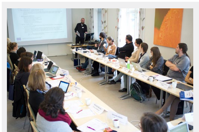
CESSDA Expert Seminar, Bergen, Norway, September 2017.

The topic of CES2017 was 'The legal and ethical framework for the use, reuse, and archiving of new types of data'. The focus was on exchanging experiences with new types of data, such as social media data, geo-data, biomarkers, administrative data, register data between CESSDA Service Providers as well as discussing how the GDPR would affect archiving these types of data. The audience of the seminar was staff working with data management in their archive. There were 23 participants, representing thirteen different Service Providers and CESSDA Main Office.